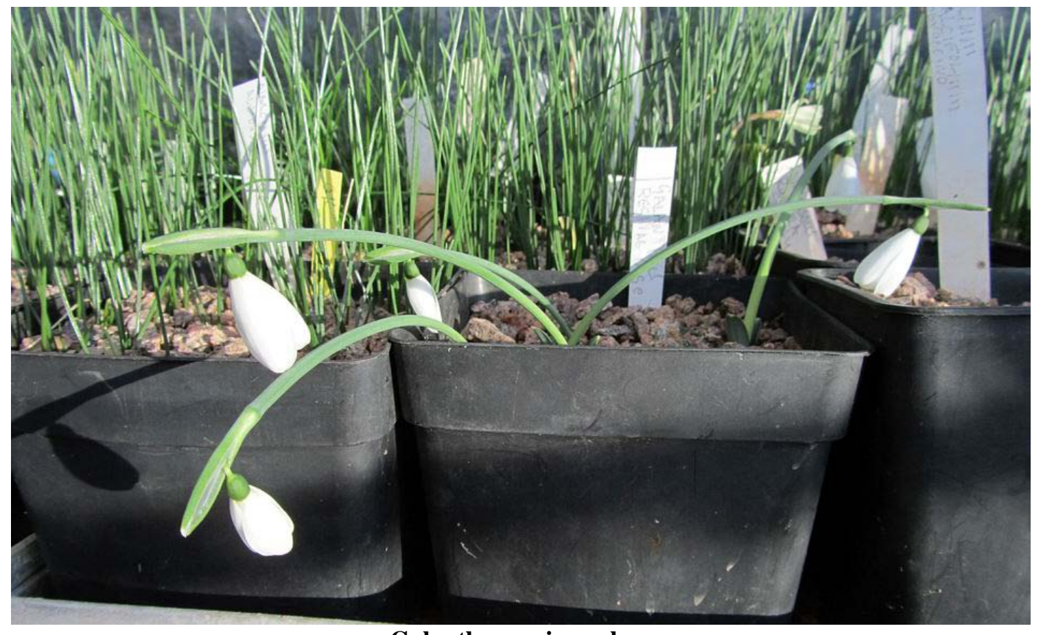
Galanthus reginae olgae

In the bulb house the stems of these Galanthus reginae olgae flop over as the water in the pots is frozen and locked up. This is a typical reaction displayed by many bulbs in this stage of growth when freezing conditions occur. I am not entirely sure if it is a conditioned response to protect the stems and flowers or just a symptom of a lack of water in the cells so they become floppy.