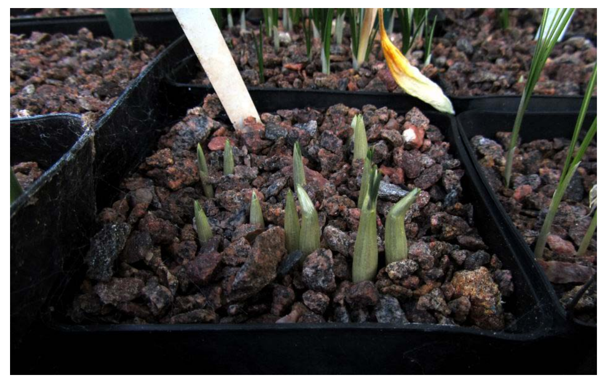
Crocus michelsonii shoots

In bulb log 45 I showed a picture of this pot of Crocus michelsonii with the shoots just emerging. Despite the cold conditions they shoots have continued to push through showing how these winter growing bulbs do not require much in the way of heat to grow slowly.