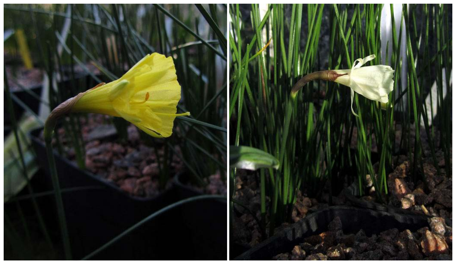
Narcissus seedling and Narcissus cantabricus foliosus

Here you can compare the colour of the stray Narcissus seedling with a Narcissus cantabricus foliosus. The seedling is almost certainly a Narcissus romieuxii form or hybrid and good strong yellow forms are very desirable.