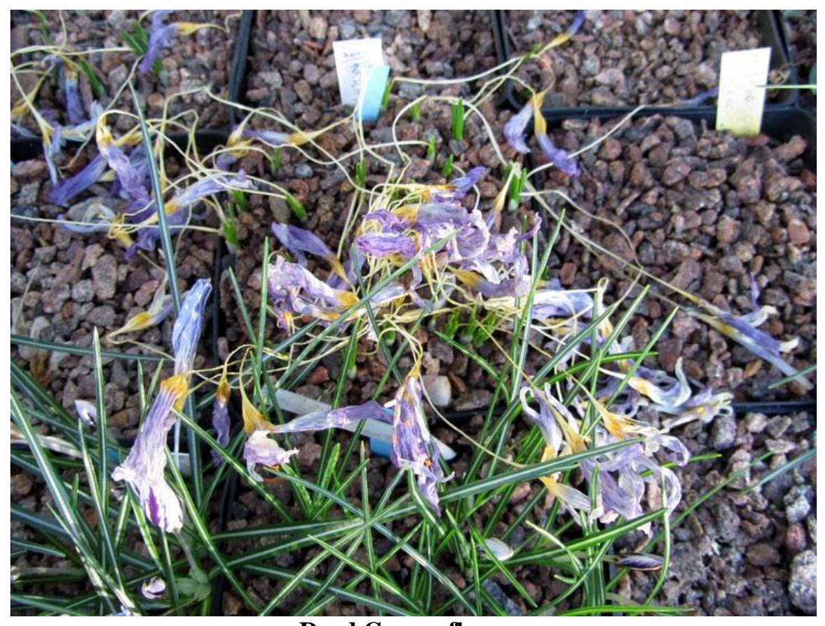
Dead Crocus flowers

It may not seem too urgent to remove these dead flowers because they are sitting on gravel and due to the freezing conditions locking up the moisture no mould is forming but as soon as the frosts lift the mould will start.