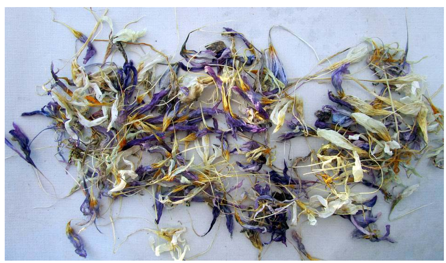
Dead Crocus flowers

No matter what the weather it is important to have a daily check in the bulb houses to ensure all is well and if it is not, to take steps to rectify any possible problems. Checking that my soil warming cables are coming on to minimize the extent of the cold penetration is one of my daily checks. It is amazing to see the difference they can make when I compare the plunges that have a cable with those that have no protection. The Galanthus with the flopping stems shown on page 2 has no protection - others on a protected plunge are still upright.